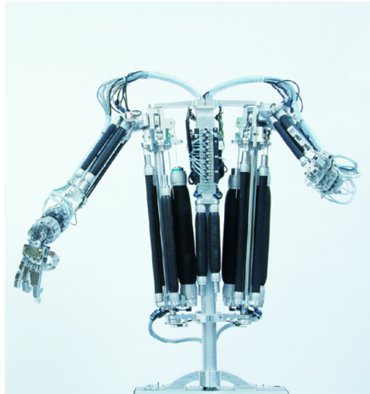
Fig. 2. The humanoid robot torso ZAR5 with two arms and two five-finger hands

The whole robot is 190 cm tall, the torso – the upper part of the robot – has a human shape and a weight of about 45 kg and is thus similar to humans of this size. The humanoid robot torso is developed according to a biologically inspired approach as far as possible. Not only the shape, proportions and radii of action but also the deeper and major qualities like skeleton, joints, muscle-tendon systems and data processing of the archetype man are implemented. The company Festo has provided the linear actuators of the fluidic muscles [1]. Tendons of Dyneema ® filaments are used to convey the tractive force to the joints regarding tensile strength, lightweight and little bending radius.